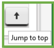
Figure 3: Scroll to Top of Screen