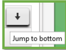
Figure 2: Scroll to Bottom of Screen

All grids in Metrc have been updated to include two new buttons on the far right of the interface. These scroll buttons allow users to select to jump to the top or bottom of the respective page that they are on.